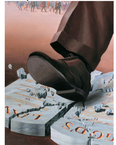
Mankind the world over is trampling upon the Sacred Laws of Allah.

Holy will. If we so desire, God will write His holy and sacred Law into our very hearts and minds, and we shall have a desire to do them. We shall even be empowered to keep His holy Law.