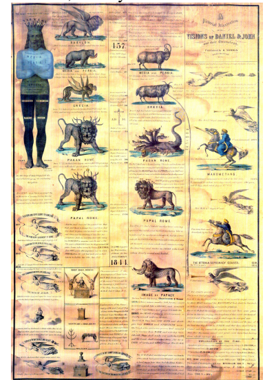
In 1850 a chart was drawn up which shows the Woe Angels as Islam in Bible prophecy of Revelation 9.

“When the sixth angel sounded, it was commanded to take off the restraints which had been imposed on the nation, ... and their commission was enlarged so as to permit them to slay the third part of men....” Uriah Smith, Daniel and the Revelation , 1897, on Revelation 9:15. They fully carried out this prophecy, and Constantinople fell into the hands of Muslims. The Eastern Roman empire collapsed. Today that same city is named Istanbul, Turkey.